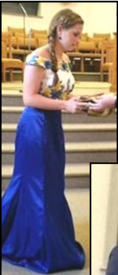
Youth taking up the offering in their prom attire.