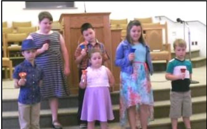
Children's Choir singing & ringing during worship.